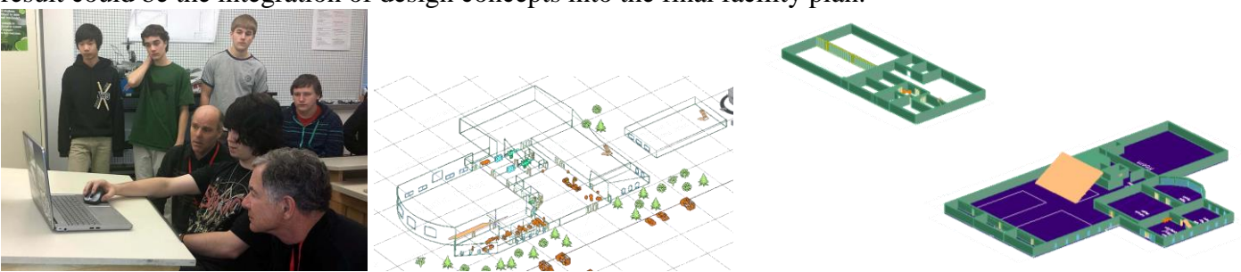
"Excellence in America's Workforce Begins with Excellence in Workforce Education"

Students from the CADD program have been collaborating with representatives of the White Mountain Aquatic Center in the design of a potential new aquatic facility for the Mount Washington Valley. All students submitted design proposals to the Aquatic Center representatives who then narrowed the design concepts to three. At this time students have reorganized in teams around the three design concepts to further refine their ideas. The end result could be the integration of design concepts into the final facility plan.